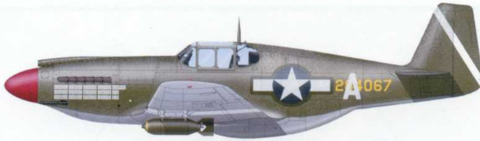
THE NORTH AMERICAN A-36

The A-36 dive bomber was the first U. S. Air Force version of the P-51 "Mustang" developed for Britain in 1940. It was provided with dive brakes and underwing racks, to operate in a close-support role. It first flew in October, 1942. Unofficially named "Invaders", they were assigned to the 27th and 86th Fighter-Bomber Groups.