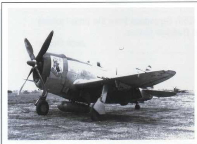
One of the newer "bubble canopy" Thunderbolts